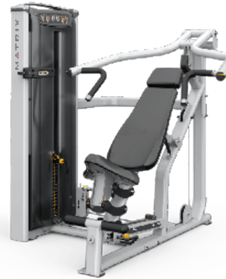
VERSA MULTI PRESS