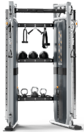
VERSA FUNCTIONAL TRAINER W/30" STORAGE