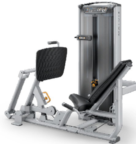
VERSA LEG PRESS / CALF PRESS