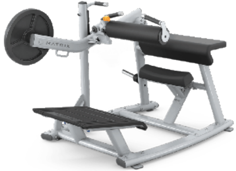
MAGNUM GLUTE TRAINER