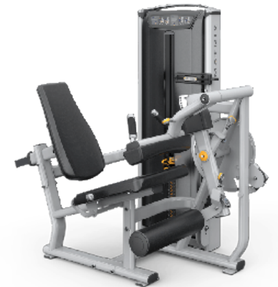
VERSA LEG EXTENSION / LEG CURL