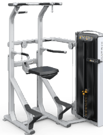
VERSA CHIN / DIP ASSIST