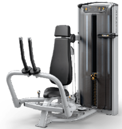
VERSA PEC FLY / REAR DELT