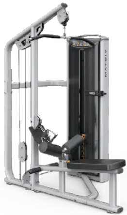
VERSA LAT PULLDOWN / SEATED ROW